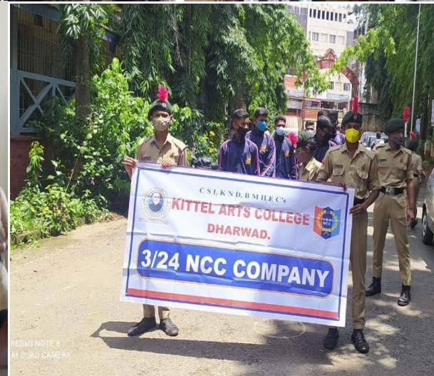
Free Vaccination camp