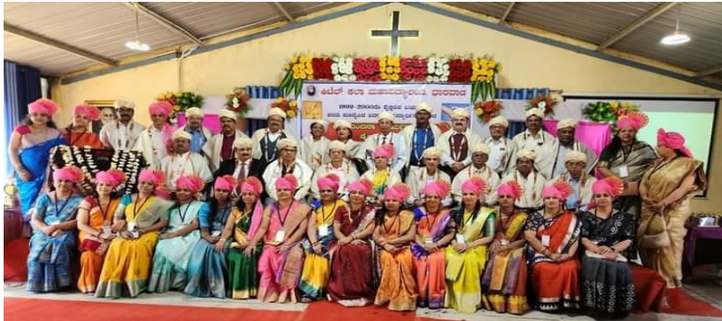
“Guruvandana” a unique felicitation programme by alumni