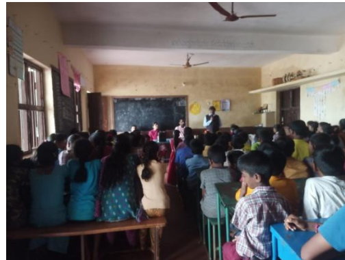
BETI BACHAO AND BETI PADAO PROGRAM AND LITERACY AWARENESS PROGRAMME IN HALLIGERI HIGH SCHOOL ON 13-8-2022