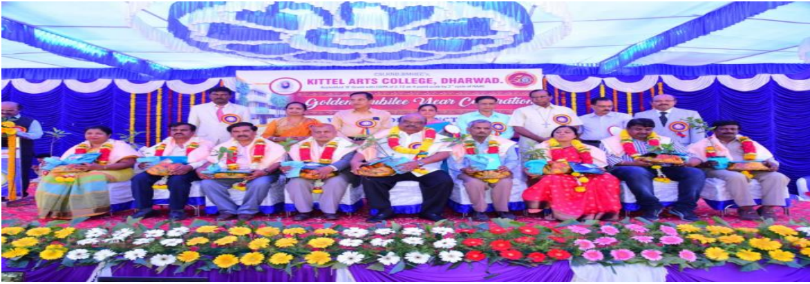
Felicitating alumni in Golden Jubilee ceremony