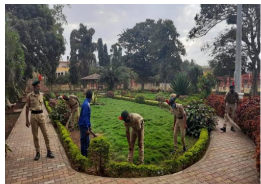
NCC cadets cleaning at Corporation garden