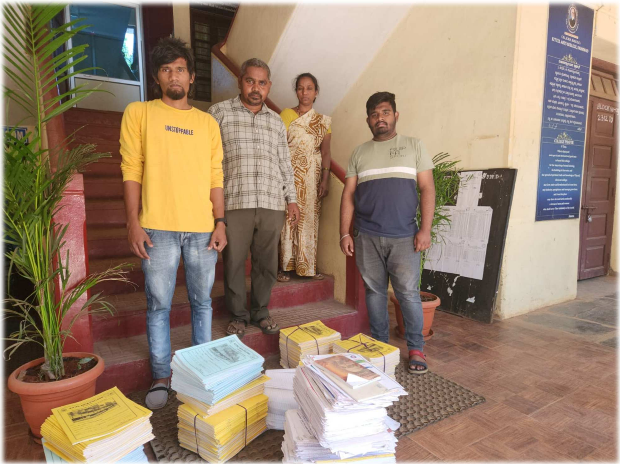
Paper waste in the institution sent to recycler