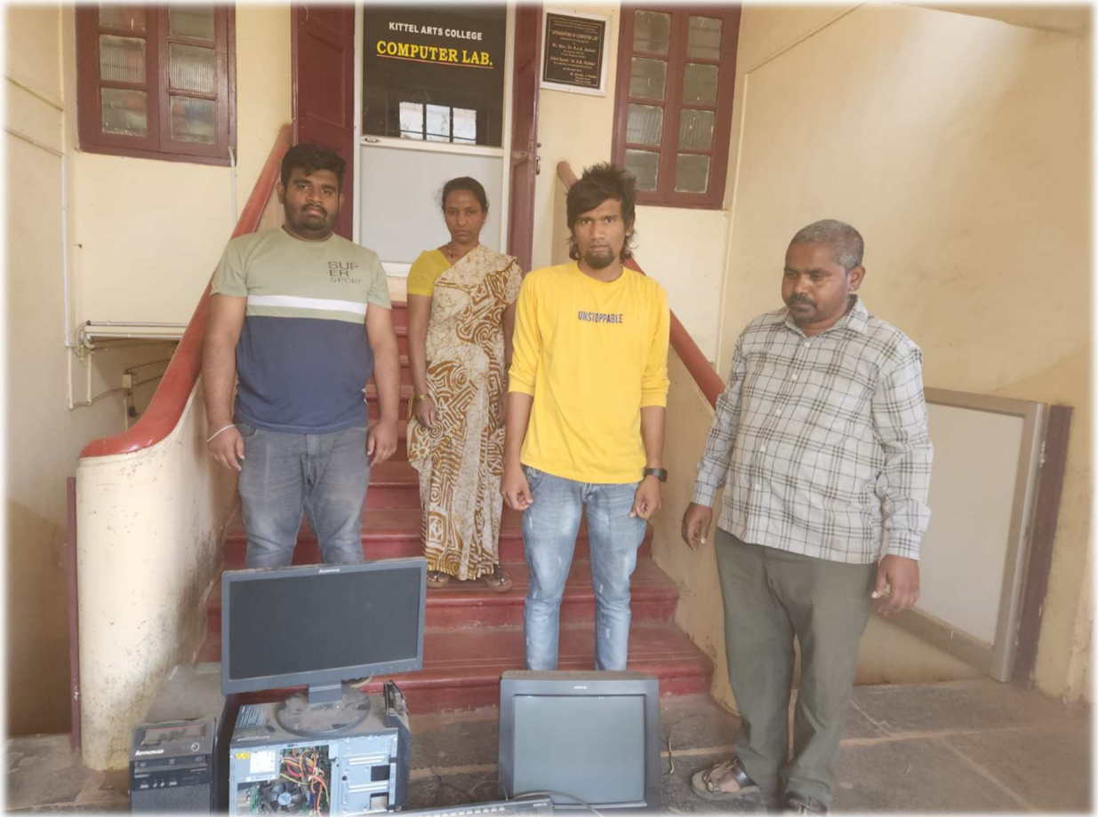
Electronic waste in the institution sent to recycler